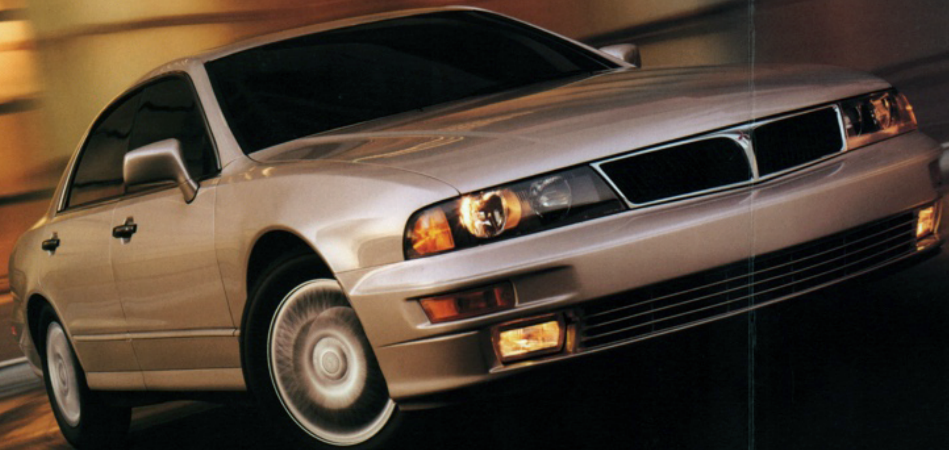
Model: Diamante LS with All-Weather Package

THERE ARE NO WRONG TURNS. ONLY EXTENDED DRIVES.